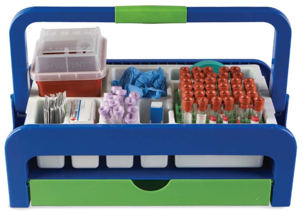
US Patent No.D904026